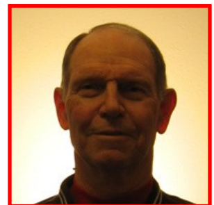
Face In Deep Shadow