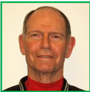
Desired ID Photo