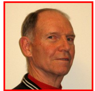
Not Facing Camera